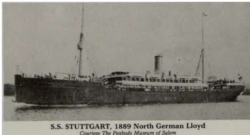
Steam Ship Stuttgart

*Immigrated from Volhynia, Germany in 1893